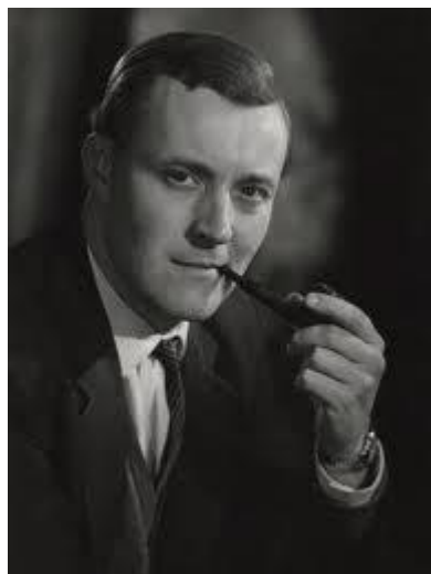
Sir Anthony Wedgwood-Benn

Produced by: B.M.Combustion, London WC1N 3XX