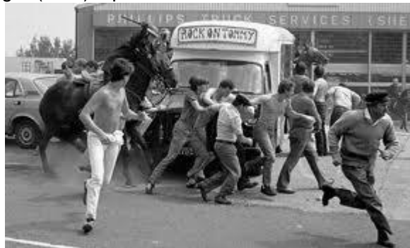
Orgreave cops against miners

Late May at Bentley (Yorkshire) concrete blocks were thrown into the cage and chimneys were destroyed. At Silverdale (Staffs) the pit cables were cut. At Harworth (Notts) pit offices were ransacked. At Betteshanger (Kent) 8 pickets held and blocked the bottom of the pit.