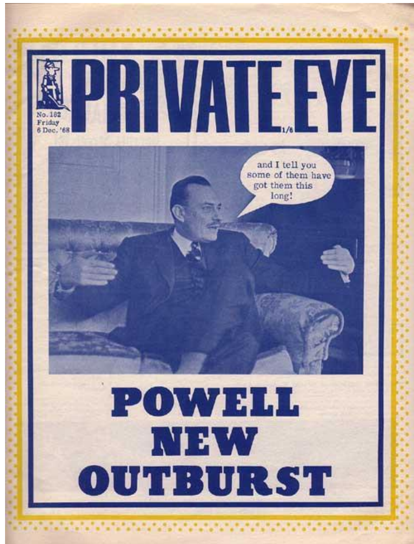
1968 Private Eye cover

As a somewhat independent' member of the ruling class, detached at least from any party allegiance, after having been kicked out of the Tory Party for his racist demagoguery and after urging voters to support the Labour Party in 1974, Powell could occasionally express openly what other rulers dared only mutter in private. Of course, he had to pose things in terms of resentment', rather than class anger because for the ruling world there cannot be any reversal of perspective, any fundamental hatred of hierarchy - it's all just a matter of envy and spite. Nevertheless, substitute the word "hatred" for resentment and Powell's quote is a lucid insight into the atmosphere of Britain in 1984. And now? - there is far less real hope now than in 1984 because at that time practical hope was being developed in the subversion of the "destination towards which those living under authority [were] being inexorably borne"- but now people with plenty of false hope are "listening" much more to the dominant authority of the commodity economy, even if they bemoan all its results, precisely because the hope of some genuine