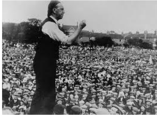
Ready - Steady - Cook (during the General Strike)... ...those who make arfur revolution dig naught but their own graves...

The miners themselves continued to strike for over 7 months after the General Strike but in almost total isolation. Due to lack of support, combined with poverty and starvation (though, as in the Great Strike almost 60 years later, soup and meals were provided, and there were collections through benefit concerts), the strikers were humiliated back to work.