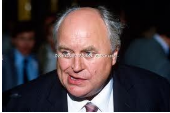
Norman Willis: no noose is bad noose

Goldthorpe: a bus driver driving scabs to work had his bus attacked and broken into and he was beaten up. Frickley: 42 cops injured. Barrow: power line brought down. Celynen pit: cops bring out the riot shields for the first time against missiles, as 18 miners refused to accept the decision of a mass meeting of the 12 th to continue supporting the strike, and turned into scabs. Strikers occupied NCB premises, and were evicted by the cops, whilst tyres of a TV crews van were let down.