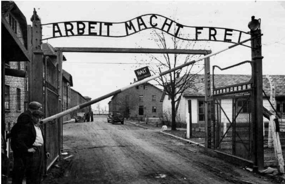
Inscription at the gate of Auschwitz: "Work Makes You Free"