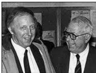
Scargill and MacGregor before the strike

Jan/Feb 1984 : Action by Scottish miners at Bogside and Polmaise pits against closures. Spontaneous walk-outs throughout Scotland in response to new shifts and productivity deal. Scottish NUM executive meeting refuses to call an all-out strike, saying there is no support. Polmaise miners storm out of the meeting and attack McGahey. March 1984 : The confusion during the present strike is just the culmination of years of confusion caused by the NUM's divisive manoeuvres. The NUM, like other unions, defends its own power and influence within the capitalist system, the same system whose crisis has caused the run-down of the coal industry. Thus the 'victory' McGahey claimed at Monktonhall was simply an NCB agreement to consult the NUM before making further closures . The NUM accepts the need for these closures. It supports token actions by miners, but has consistently opposed or sabotaged any effective action.