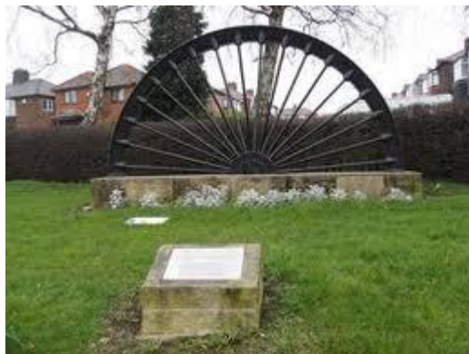
the aestheticisation of history (Kiveton Park today)

As virtually everybody reading this will know, these tendencies are by no means confined to the former mining areas, though they seem to be more intensified there. Whilst the defeat of 1926 was brutal, the difference between now and then is that in the aftermath of 1926, an aftermath which lasted generations, there was at least a community of class hatred towards the ruling class and its middle class minions. Nowadays, particularly amongst most of the young, there's just an individual consciousness perplexed by the meaninglessness of life and at a loss to comprehend the reason and history of this meaninglessness. This society tries to wipe out all memory of what was radical in these former communities - either by aestheticisation (former pithead winding wheels turned into sculptures; pits made invisible by being covered over and turned into parks; pits turned into museums for tourists; the Battle of Orgreave re-enacted by historic societies; movies showing the tragedy of it all; etc.) or by more direct lies, lies by omission and ideologies.