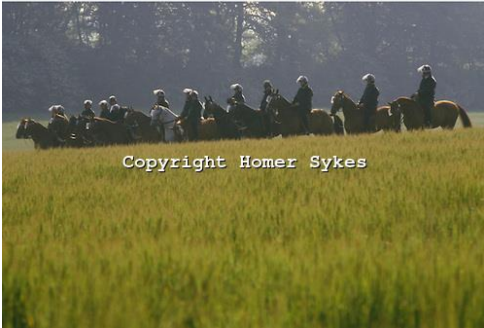
England's green and pleasant land: Orgreave 1984