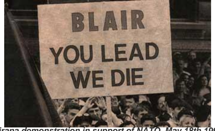
Tirana demonstration in support of NATO, May 18th 1999 (strangely, no irony was intended)

There was a report half way through the war of an Italian refugee charity arriving at the border of Kosovo with a camera crew and ambulance, and spiriting away an old woman refugee who'd collapsed - all of it faithfully filmed for Italian TV. It was the first time during the war the charity had done anything. It turned out that the woman had merely fainted - and, as a result of this dramatic intervention she became extremely upset, hardly surprising, since she'd been separated from her family who, in the meantime, had been shoved off to some other refugee camp, and no-one knew where they were. Once you enter this world of TV, of image, of the appearance of goodness, "care", "charity" & "humanitarianism" are but masks for indifference: everything 's just a photo-opportunity. The more all-pervasive these role-bound relations are the more such functionalising of people appears as natural'. The media is simply an arm of the State, making modern alienated spectacular relations seem reasonable and inevitable.